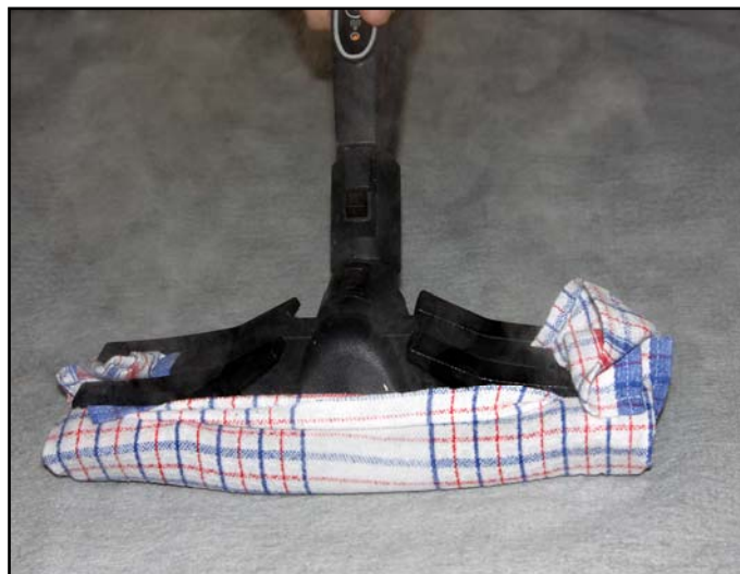
Figure 15. Covering the steam head with cloth will ensure that bugs will not be blown about, yet the temperature will be high enough to kill the insects.

Steam flow rate must be kept to a minimum to avoid blowing bed bugs about (along with exuviae which may contain eggs and nymphs) and to reduce wetting. Likewise, single jet steam nozzles can blow bed bugs away. If such nozzles are used on mattresses then the nozzle should be always pointed towards the centre of the mattress where propelled bugs can be seen and re-steamed if still alive. Multiple jet steam heads produce a gentler flow rate, are thus less likely to blow bed bugs away and can treat larger areas over a shorter period. In comparison for example, with single jet nozzles it will be necessary to run the nozzle along both sides of edge beading, whereas a single pass with a multiple jet head placed over the beading will usually suffice. By placing a cloth over the steam head as in Figure 15, bed bugs will not be blown about by the jets and the treated surface