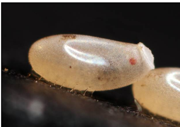
Figure 14. Bed bugs eggs are glued down when laid, which means that they resist removal via vacuuming.

It is important that the vacuum machine does not become the source for further infestations so it must be properly 'disinfected' following use and only be used for pest control. Vacuum units that have the base and all hoses composed of solid plastic can be readily sterilised in hot water (Figure 13). This should be done as soon as possible after use. When not in use the vacuum unit itself should be stored in a sealed bag.