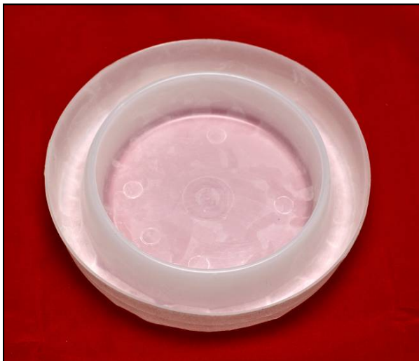
Figure 16. The 'Climbup Interceptor' barrier.

Many barrier devices are quite obvious and unlikely to be used in the commercial accommodation market for the same reasons relating to reputation threats as mentioned with traps. However, barriers can be a cost effective option in low income housing and homeless shelters. Despite barriers not having any attractant, they can trap bed bugs and could play a monitoring role. As these devices are based on old proven technology, they are likely to be effective.