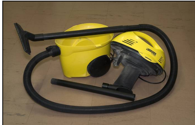
Figure 13. Vacuums such as this 'wet & dry' unit are ideal for bed bug control. All surfaces that may come into contact with bed bugs (such as the base and hoses) are composed of solid plastic and can be readily sterilised post use with very hot water. Importantly, this vacuum also uses disposable bags.

disposable dust bag. A crevice nozzle can be used along carpet edges, bed frames, mattress seams and in ensemble bases, furniture, and other potential harbourages. Vacuuming cracks and crevices prior to insecticide treatment will not only remove the bugs but dirt as well, which will allow the chemicals to penetrate better and improve their residual effect. After vacuuming is complete, the contents must be sealed within a plastic bag. This should then be destroyed by incineration if possible, rather than just being placed into the general rubbish. If incineration is not possible, then apply insecticide dust to the contents and seal in a plastic bag prior to disposal. Under no circumstances should an insecticide aerosol or spray be applied to an operating vacuum machine as this may cause an explosion and/or fire. Vacuuming insects can cause a dispersion of insect allergens, which may be a problem in sensitised people and trigger an asthmatic reaction. If clients report being sensitive to dust mite or insect allergens, then using a vacuum machine with a HEPA filter is advisable.