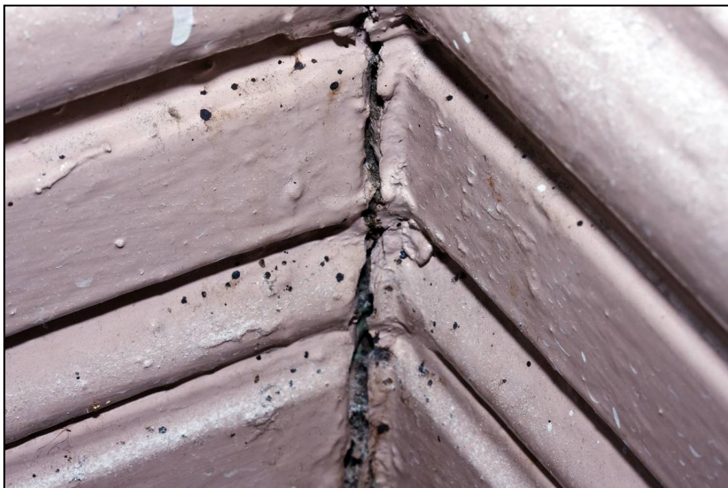
Figure 10. A large crack is present in the corner of the skirting and bed bug spotting is evident. Poor room integrity always makes bed bug control more challenging.