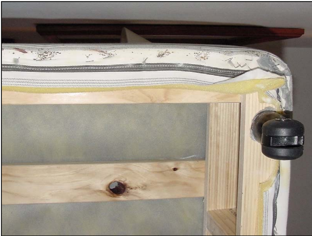
Figure 7. Ensemble bases make great bed bug motels due to the large number of harbourages. Blood spotting can be seen in groups along the top, which is between the staples that hold the material that covers the underneath.