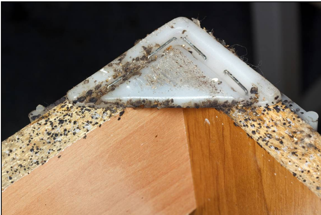
Figure 12. Underneath a chest of drawers showing massive bed bug activity. Chipboard furniture is very bed bug 'friendly' and can be very problematical when bed heads are constructed of this material.