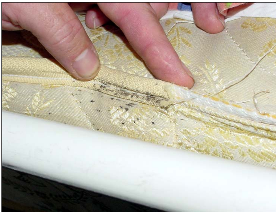
Figure 4. Blood spotting on a mattress, which is typically grouped, indicating the gregarious nature of the insect. No bed bugs can be seen in this image.