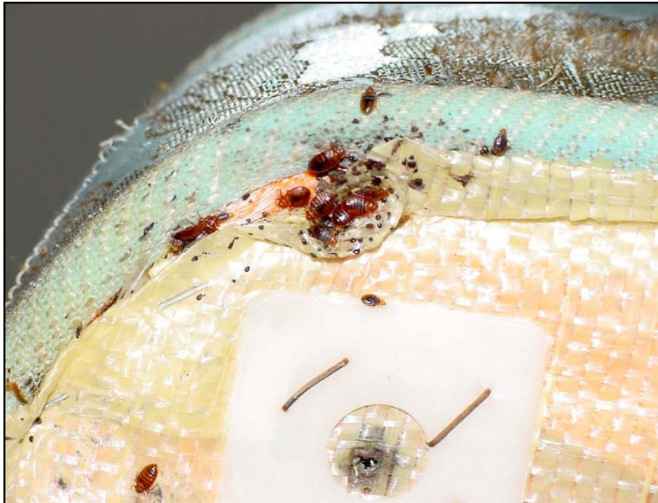
Figure 5. A massive bed bug infestation in an ensemble base. It is always necessary to remove the material covering the base in order to treat the infestation.