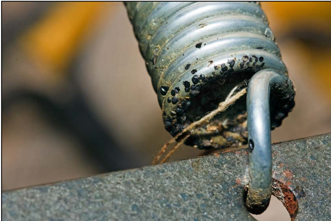
Figure 8. Metal bed springs make an excellent bed bug harbourage and are a challenge to treat. Extensive bed bug faecal spotting is evident.