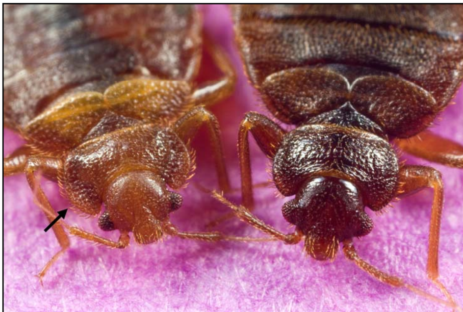
Figure 2. Adult bed bugs. The Common species ( C. lectularius ) on the left has a lateral flange on the margin of the pronotum (arrow), making this structure wider than that of the Tropical species ( C. hemipterus ) on the right.

shape to that of an apple seed. There are five nymphal stages that have a similar body shape to the adults but start out translucent and cream in colour in the first instar (or 'stage'), becoming darker in the later instars. The size of the juveniles varies between 1-4mm depending on growth stage (Figure 1). Currently in Australia there are only two species of Cimex , which are both introduced; Cimex hemipterus (the Tropical bed bug) and Cimex lectularius , (the Common bed bug). The Tropical species occurs mainly north of the NSW/Qld border and the Common species to the south, with some overlap between northern NSW and southern Qld. The two species are taxonomically differentiated on the basis of the shape of the pronotum of the thorax; the Common species having a pronounced lateral extension of the pronotum and thus is much wider than that of the Tropical species (Figure 2).