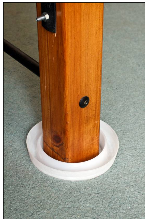
Figure 17. The 'Climbup Interceptor' installed underneath a bed leg.