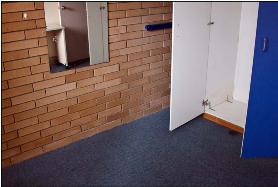
Figure 11. Exposed brick work is very challenging to treat for bed bugs and requires extensive spraying along all mortar lines.