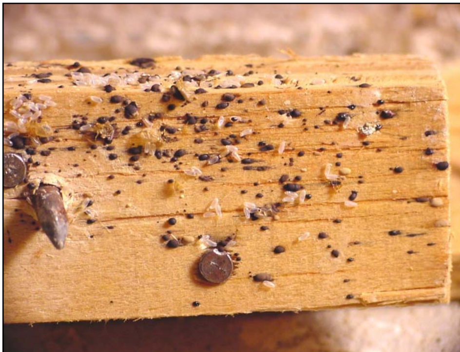
Figure 6. The 'straight edge' that holds the carpet in place. Numerous eggs and blood spotting are evident. For more bed bug related images see Doggett (2005).