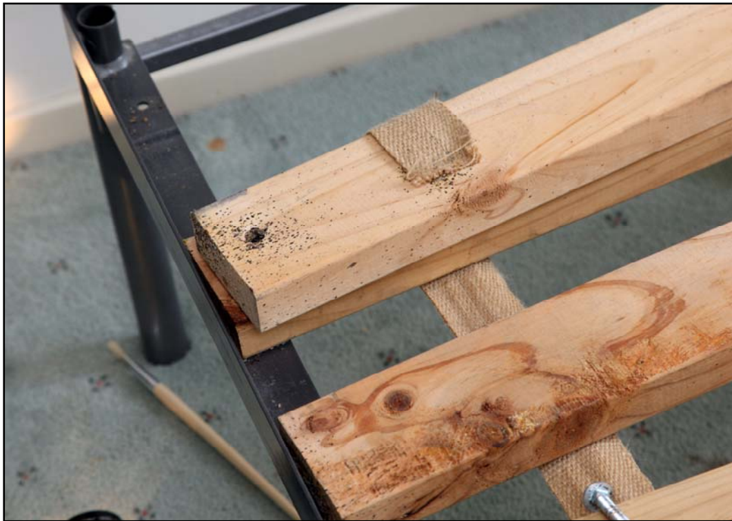
Figure 9. Wooden bed slats provide numerous bed bug harbourages.